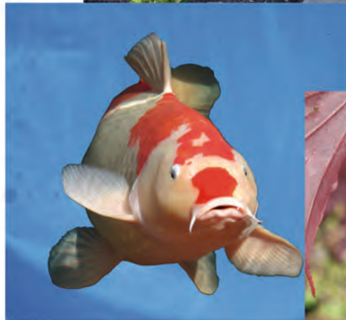
Impressive and Friendly