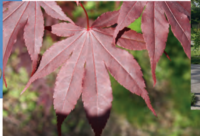
Japanese Garden at Carmel City Center