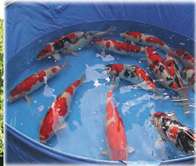
Beautiful Koi at the ZNA Show