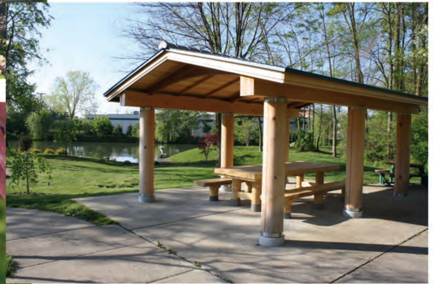
Japanese Cedar Shelter

Learn about Koi, discover the possibilities of your own koi pond or water garden from the show's vendors and enjoy this great event that marks the beginning of summer. Donations support the Japanese Garden at Carmel City Center