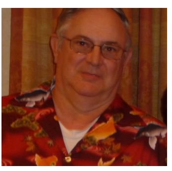
Reserve Grand Champion