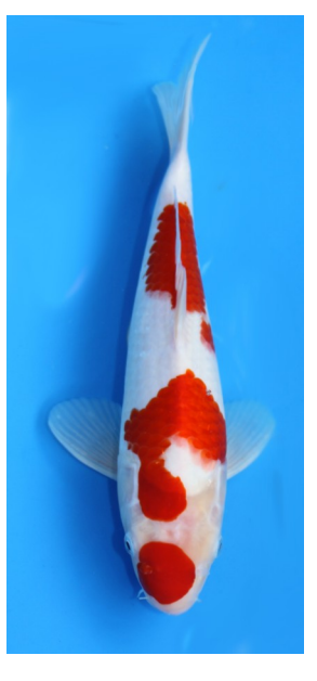
SIZE 3 Phil Gray