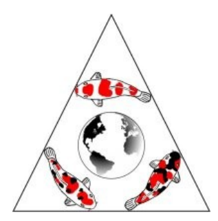
Grand Champion "B"