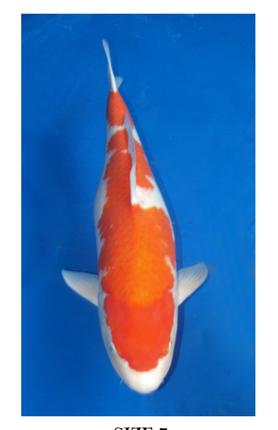
SIZE 7 Dave DeWalls