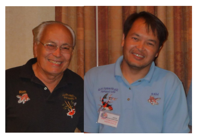
Junior Champion Baby Champion