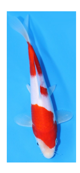
SIZE 1 Mike Pfeffer