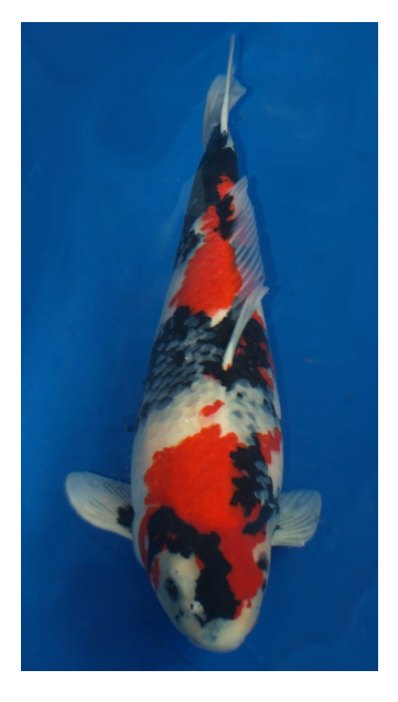
SIZE 6 Dave DeWalls