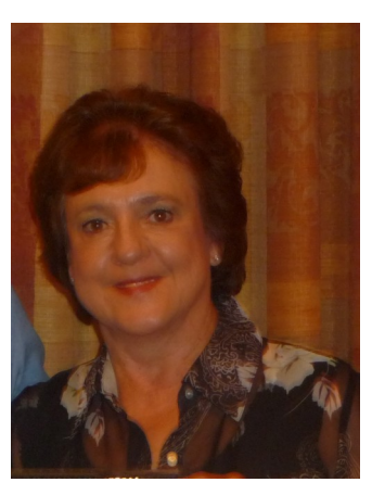
Best Male Award